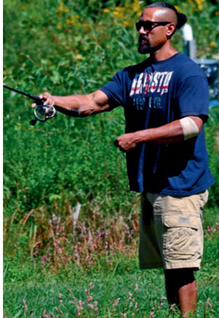
PHOTO: Fishing programs are offered seasonally at select forest preserves.