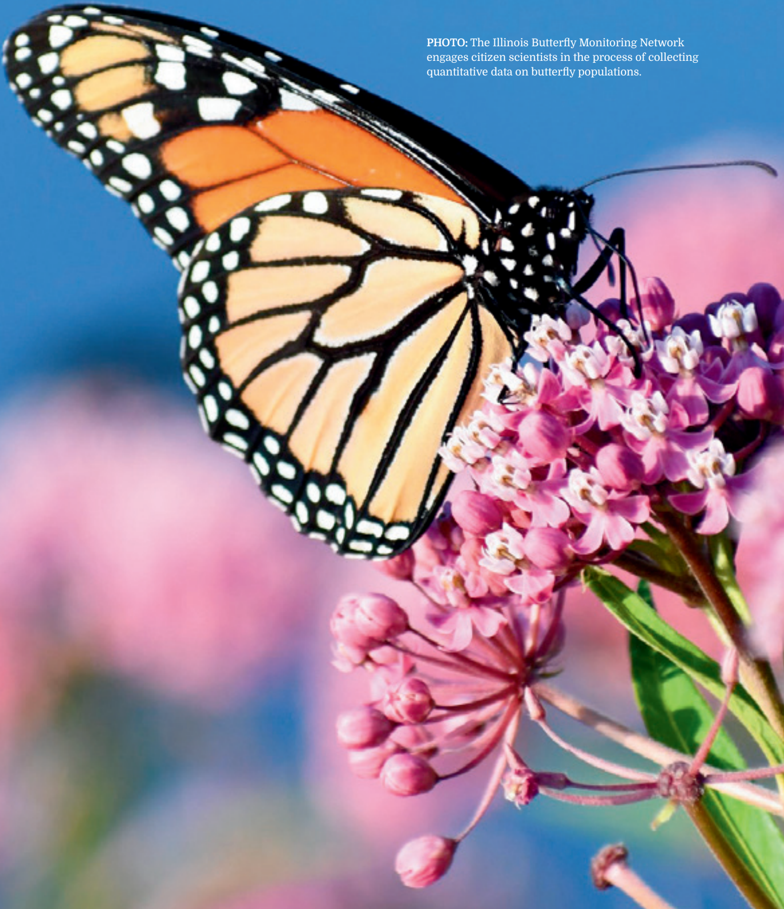
PHOTO: The Illinois Butterfly Monitoring Network engages citizen scientists in the process of collecting quantitative data on butterfly populations.