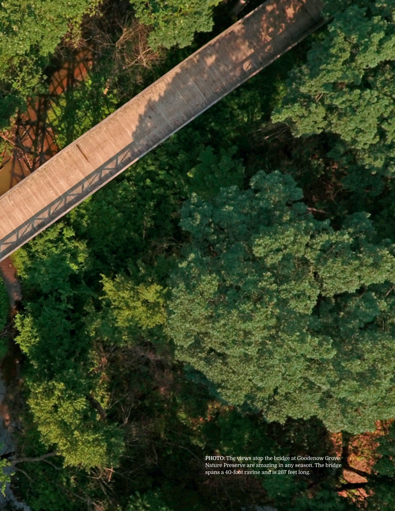
PHOTO: The views atop the bridge at Goodenow Grove Nature Preserve are amazing in any season. The bridge spans a 40-foot ravine and is 267 feet long.