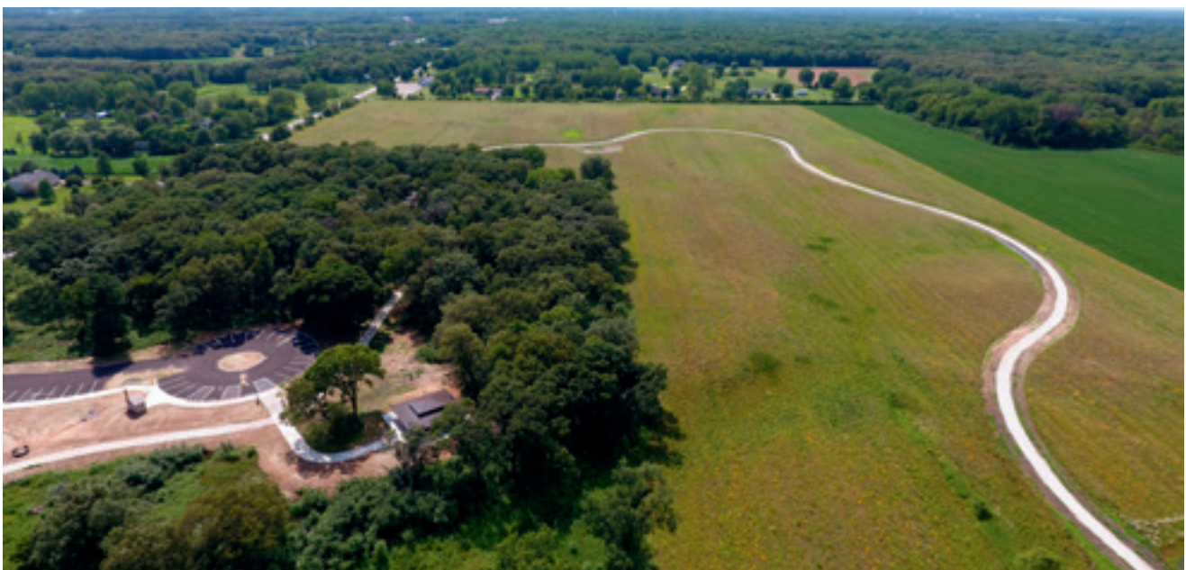
PHOTO: Kankakee Sands Preserve protects savanna and wetland habitat. A unique feature of the site is its sand dunes and savanna.