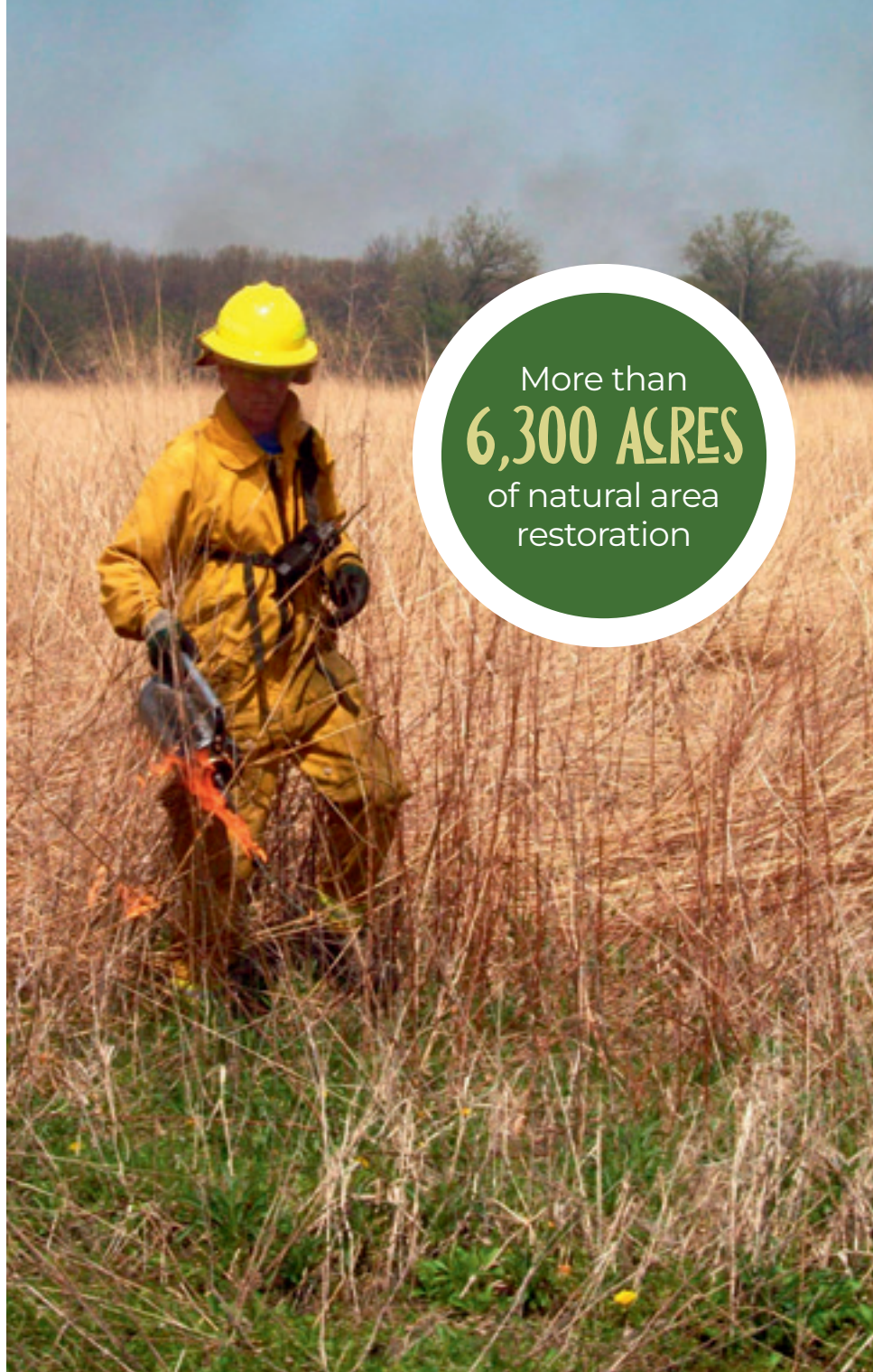
PHOTO: Controlled burning requires extensive planning, training, personnel and equipment. Planning is often underway six months or more prior to implementation.

Forest Preserve staff and volunteers collected more than 490 pounds of seed from 177 different native plant species in 2022. These seeds will be used to establish native plant communities in newly restored areas and to enrich degraded natural areas.