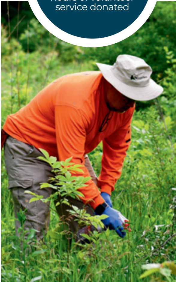
PHOTOS: Volunteers contribute in many ways, from taking part in habitat management or assisting with programs to monitoring local wildlife or serving as the eyes and ears of the Forest Preserve District while riding the trails.

More than 11,800 hours of volunteer service donated