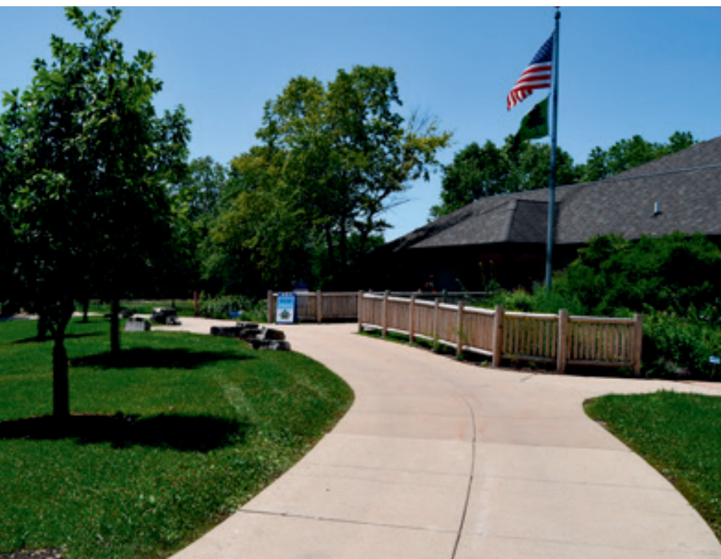
PHOTO: Isle a la Cache Museum transports visitors back to the 18th century, when "Illinois Country" was home to the fur trade.

The Forest Preserve's Police Department participated in multiple community outreach events in 2022. These included the Special Olympics Illinois Polar Plunge, Plane Pull, Torch Run, and Cop on a Rooftop. It also hosted a National Night Out event at Monee Reservoir and participated in many touch-a-truck events as well as parades.