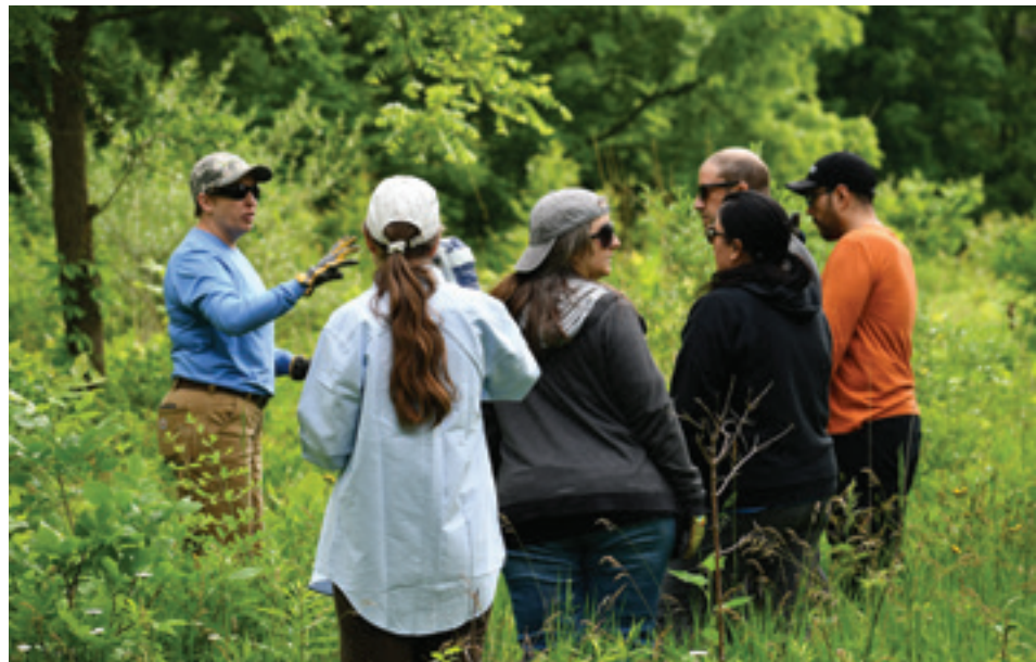
PHOTO: There are many benefits to volunteering with the District. You engage in some physical activity while meeting like-minded people. And you help improve Will County's preserves, which enhances the quality of life for all residents.