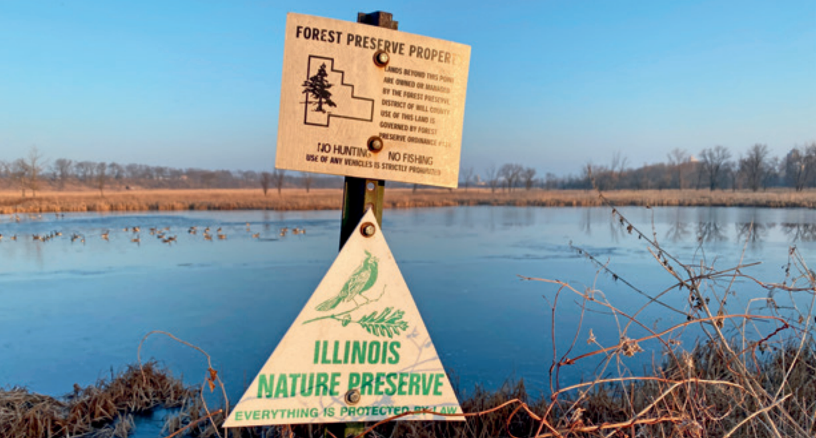
PHOTO: Lockport Prairie Nature Preserve protects a diversity of habitats, including forest, prairie, savanna, wetland and a portion of the Des Plaines River.