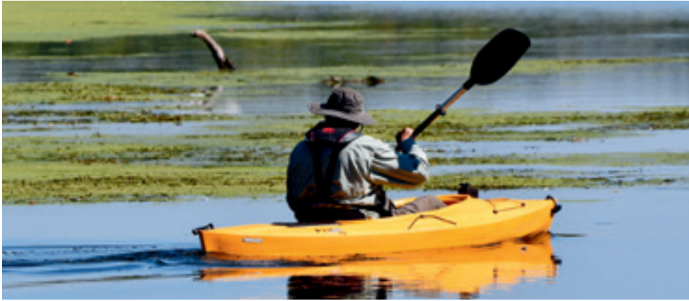
PHOTO: Paddling is a great way to enjoy nature and see the preserves from a different perspective. You can explore all the nooks and crannies and see parts of the preserves you would never be able to from land.